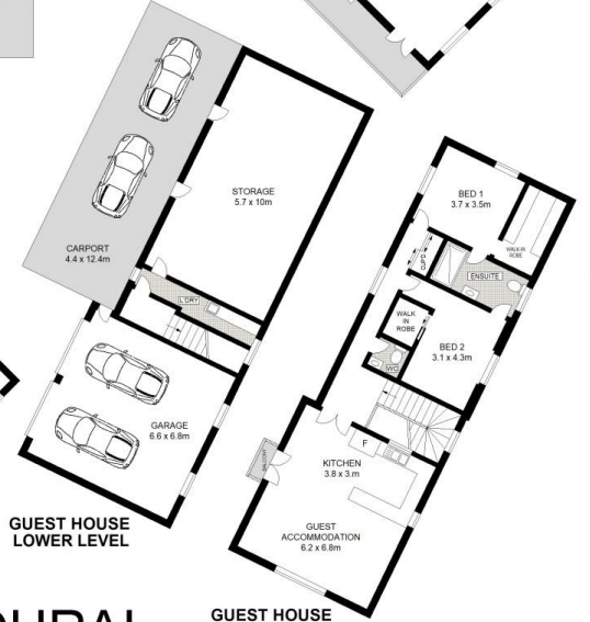
GUEST HOUSE LOWER LEVEL